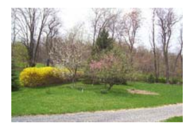
The vegetable garden is still barren. The Asparagus will be ready to pick April 28.