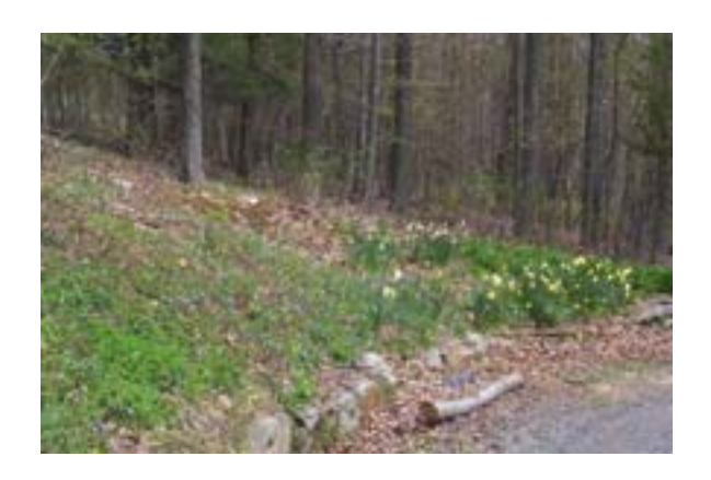
Daffodils and other spring bulbs are scattered through the woods.

Spring comes gradually to the woodland and the pasture at Centennial Springs. About the first of March the peepers announce the awakening of the pond. Later the Canada geese arrive for their annual nesting period. Finally, the spring bulbs decorate the freshly leaved woods & fruit trees and bushes bloom.