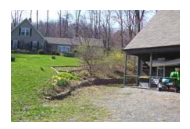
Lawn mowers move out from their winter abode in the workshop at the cottage.

Spring comes gradually to the woodland and the pasture at Centennial Springs. About the first of March the peepers announce the awakening of the pond. Later the Canada geese arrive for their annual nesting period. Finally, the spring bulbs decorate the freshly leaved woods & fruit trees and bushes bloom.