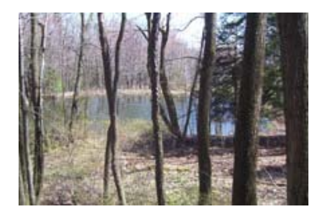
The peepers are the first sign of Spring, some years before the ice melts.