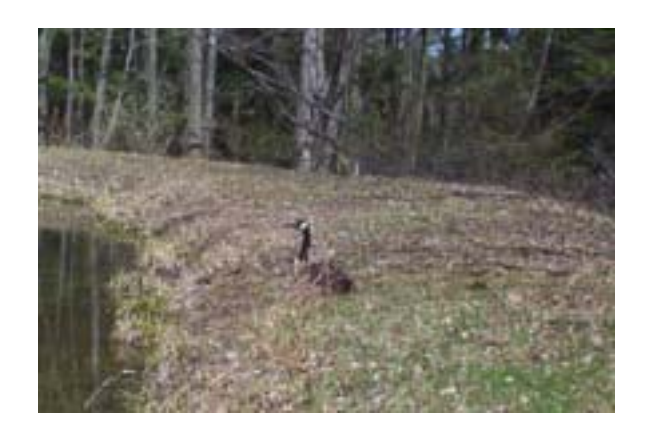
The geese come every year then move North with their goslings.