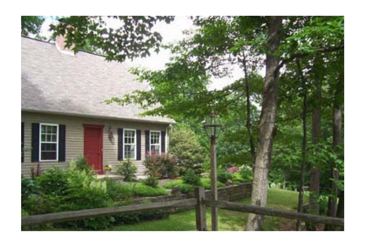
The Seasons at CENTENNIAL SPRINGS