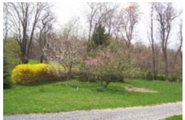
The vegetable garden is still barren. The Asparagus will be ready to pick April 28 .