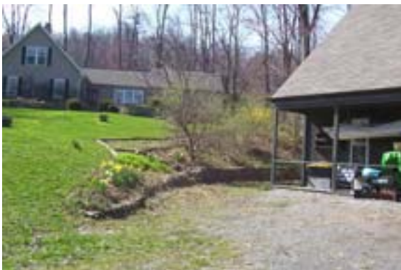
Lawn mowers move out from their winter abode in the workshop at the cottage.

Spring comes gradually to the woodland and the pasture at Centennial Springs. About the first of March the peepers announce the awakening of the pond. Later the Canada geese arrive for their annual nesting period. Finally, the spring bulbs decorate the freshly leaved woods & fruit trees and bushes bloom.