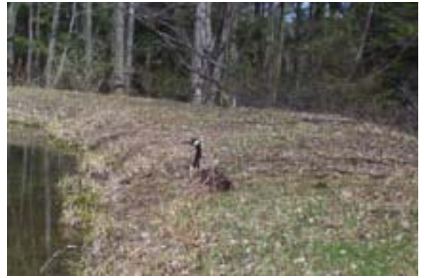
The geese come every year then move North with their goslings.