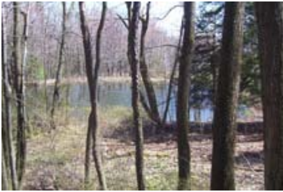
The peepers are the first sign of Spring, some years before the ice melts.