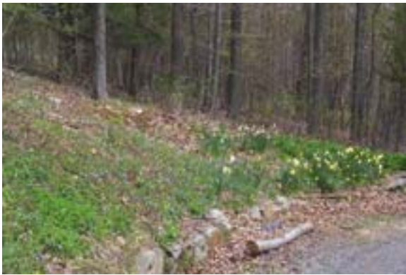
Daffodils and other spring bulbs are scattered through the woods.

Spring comes gradually to the woodland and the pasture at Centennial Springs. About the first of March the peepers announce the awakening of the pond. Later the Canada geese arrive for their annual nesting period. Finally, the spring bulbs decorate the freshly leaved woods & fruit trees and bushes bloom.